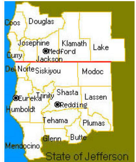
Possibly the most grandiose vision of the realm

While inhabitants in Lassen and Shasta counties in northern California flirted with joining the secession movement, only the counties of Curry, Siskiyou, Trinity, and Del Norte